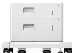
High Capacity Cassette Feeding Unit-D1*** • 2,550-sheet capacity (550-sheet upper cassette, 2,000-sheet lower cassette)