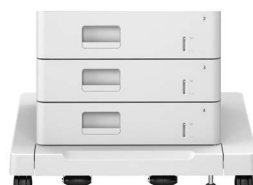
Cassette Feeding Unit-AX1*** • 550-sheet capacity for each upper, middle and lower cassettes