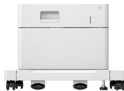
Cassette Feeding Unit-AR1*** • 550-sheet capacity and cabinet for storage